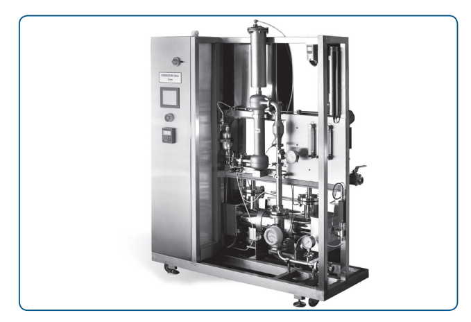
Figure 2 — LIQUOZON® Ultra UV