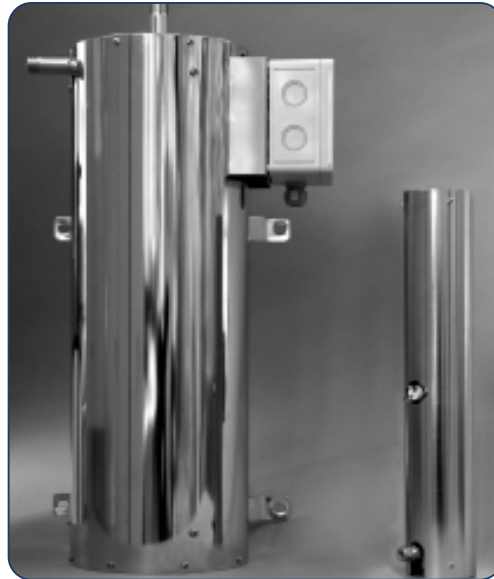
Catalytic converter for safe transformation of excess ozone process gas to oxygen