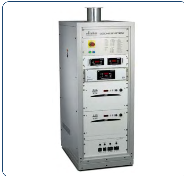
SEMOTON AX8550 Ozone Delivery System